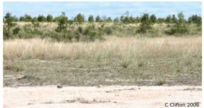
C Clifton 2006

The salinity patches may have been exacerbated by clearing, but it seems to be contained by the slope of the hill and the lake itself.