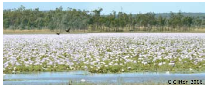
C Clifton 2006

The lake itself appears to be very healthy and does not appear at all to be threatened by the salinity (refer to photograph).